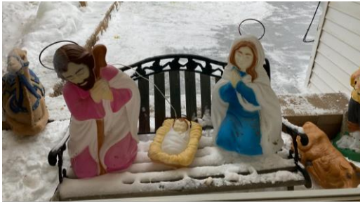
Nativity Scene set up outside the window on Oliver Lodge South by a family member.