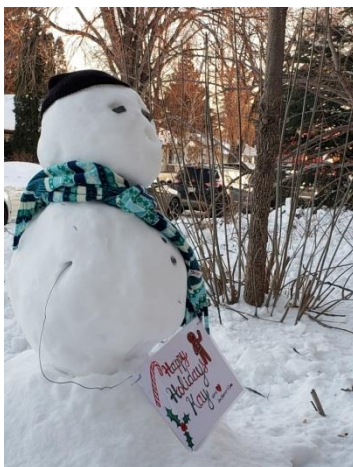
This snowman built by a family member watches over their loved one on 1 st floor.