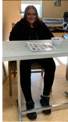
Hallway Christmas Bingo!