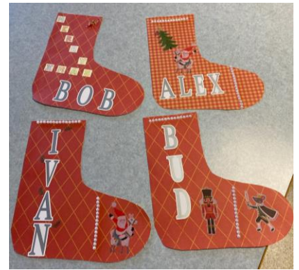
Personalized stockings are being made for each resident on Oliver Lodge South.